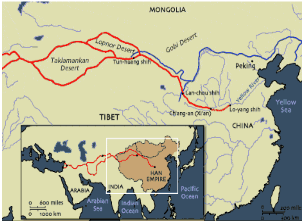
Figure 3.2. Schematic Ancient Silk Route