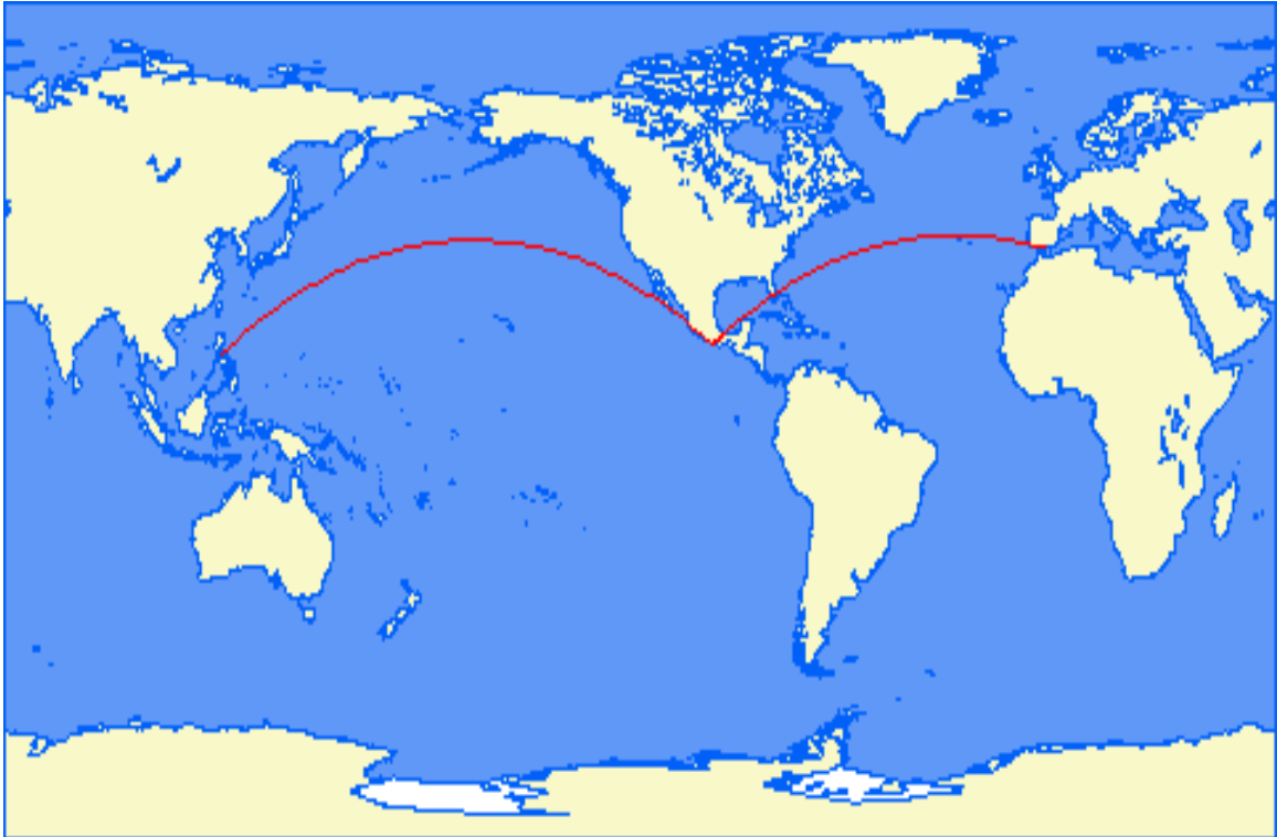
Table 5.1 Spanish Crown Trade Route (SCTR)