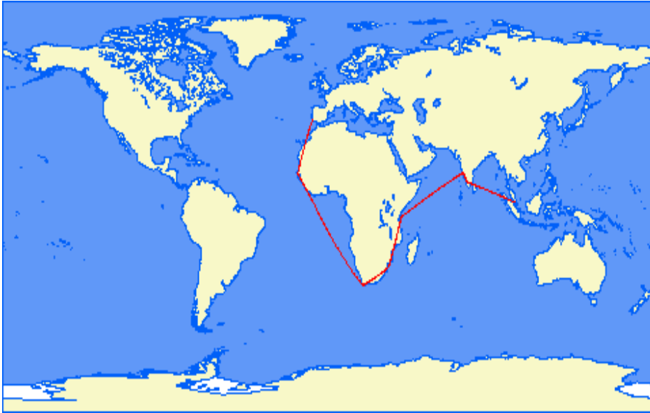
Table 4.2 Portuguese Spice Route Lisboa-Dakar-Cape Town-Maputo-Mombasa-Goa-Cochin-Malacca